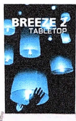
Retractable Mini table top Banner Stand that can be used over and over. Easy set-up. Graphics included in price. 11" x 17" Includes Carrying Case $36.00

ALL CANCELLATIONS FOR ITEMS ORDERED MUST BE MADE 3 BUSINESS DAYS BEFORE THE EXHIBITOR MOVE IN DATE TO RECEIVE A FULL REFUND. ITEMS CANCELLED AFTER THE 3 BUSINESS DAYS BUT BEFORE THE EXHIBITOR MOVE IN DATE WILL BE SUBJECT TO A RESTOCKING FEE OF $25.00. ANY ITEMS DELIVERED TO THE SHOW SITE OR ITEMS REQUESTED TO BE REMOVED BY THE SHOW REPRESENTATIVE FOR ANY REASON WITHOUT PRIOR CANCELLATION WILL BE CHARGED AT FULL PRICE EVEN IF REFUSED AT BOOTH.