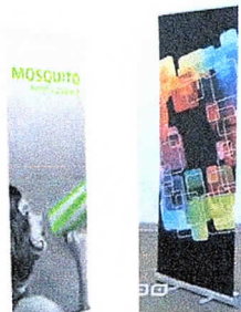
Retractable Banner Stand that can be used over and over. Easy set-up. Graphics included in price. 32" x 82" Includes Carrying Case $185.00