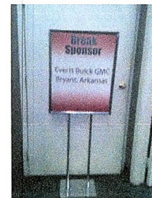
Sign Frame with graphics. Can be single-sided or double-sided. (1) single - $40.00 (2) double - $50.00

We have a wide variety of items we can customize including meter panels, banners, floor stickers, counters, displays, walls, booth decor and backdrops for themed shows. We can do all of your printing needs in house. Give us a call for any special items you may need. We will print and deliver to your booth so once you approve your order your all set!